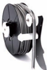
Clip on spool